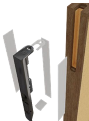
Example Flush bolt installation and intumescent protection

Gaskets must be fitted where required by supporting evidence, for example, test evidence or Certifire certificates. If gaskets are not required by the supporting evidence but are within this Field of Application, the requirements of this Field of Application take precedence.