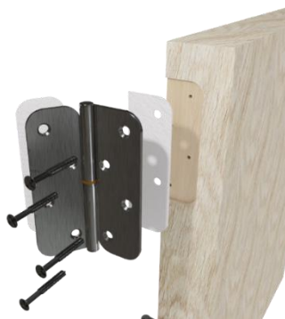
Example of hinge protection detail

Note: Halspan intumescent protection is supplied with Halspan hardware, e.g. Halspan sashlock LCK-BSS-104 comes with SLS-PAD-109. The combined product is then referenced BOM-LCK-111.